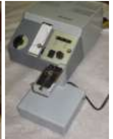
A small sample of the tools for sale