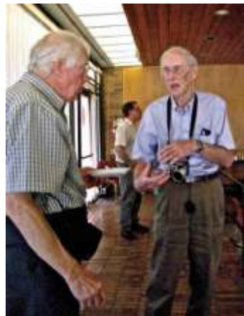
No, really. My piece of cake was this big!