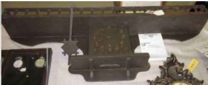
The very rare Pequegnat Woodstock in excellent condition FOR SALE $3800