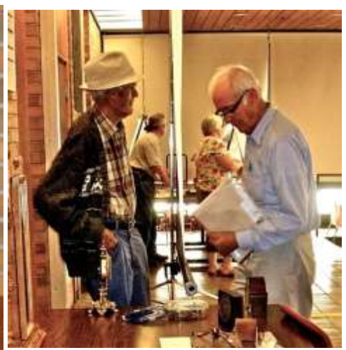
OK—where are the watches??