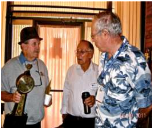
"As I was saying, this one almost got away from me, but I grabbed it by the neck...."