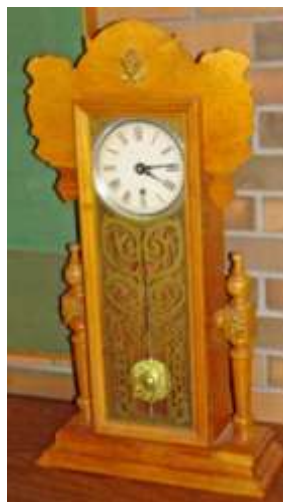
Some Mart Table Treasures