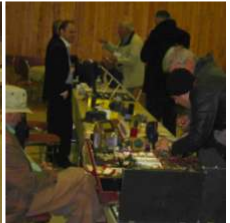
Lots of enthu-