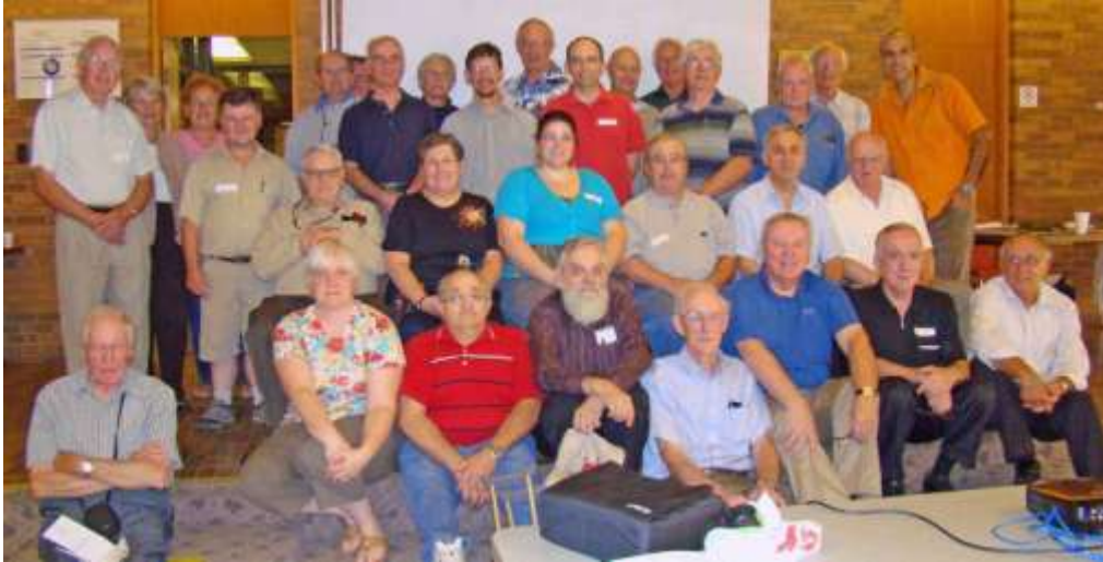
Toute Le Gang!